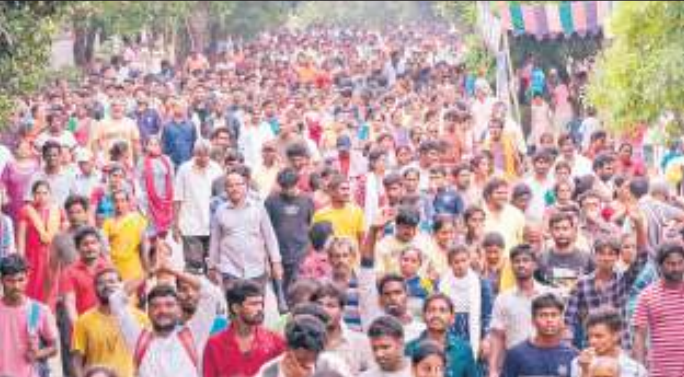
Devotees taking part in 'Giri Pradakshina' near MVP Junction in Visakhapatnam on Wednesday

The district authorities, in coordination with various civic and voluntary organisations, made elaborate arrangements to ensure the smooth conduct of the event. Nearly 300 medical camps were set up along the