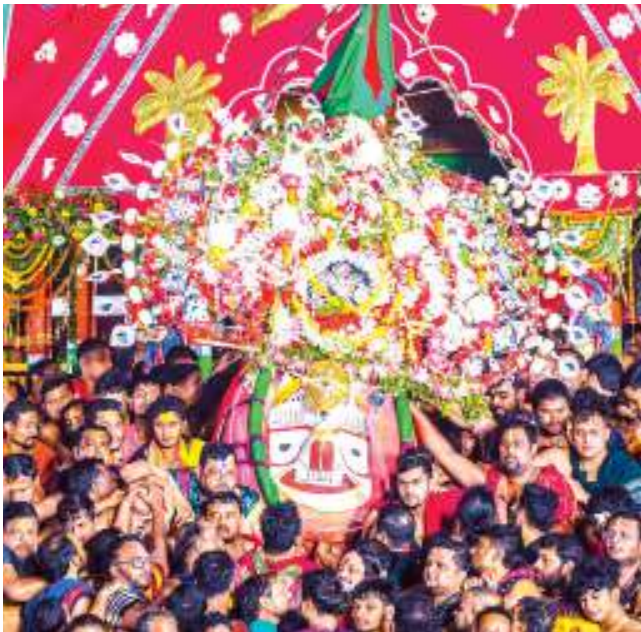
Devotees at 'Goti Pahandi' ritual of Lord Balabhadra, the return procession of the deities in Puri.

(The writer is a popular columnist. The views expressed are personal)