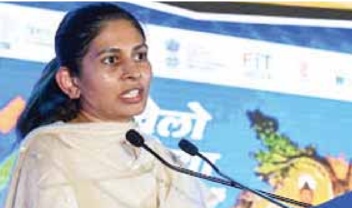
Minister of State for Sports Raksha Khadse

India's bid to host the 2036 Olympics is not merely an attempt to make a statement internationally but also a well thought out plan to create world-class infrastructure, bolster the economy and tackle pressing social issues affecting the country's youth, says Minister of State for Sports Raksha Khadse. In an exclusive interview, the 38-year-old three-time Lok Sabha MP from Maharashtra's Raver constituency, dismissed criticism from some quarters that the country needs to focus more on becoming a sporting powerhouse before aiming for something as expensive as hosting the Olympics. "Preparing to host events like the 2036 Olympics or the 2030 Commonwealth Games is about creating world-class infrastructure, economic investment and legacy systems that directly benefit athlete development," she asserted in the interaction at her office here. "Sports is also a way to deal with so many issues such as depression and even drug addiction. And keeping all this in mind, when you bring an event like the Olympics to the country, it becomes a galvanising force even socially. It creates a fitness movement of its own and enhances the output of a nation. It's a win-win