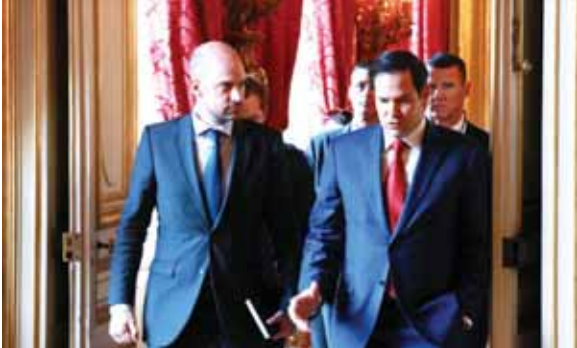
US Secretary of State Marco Rubio and French Foreign Minister Jean-Noel Barrot discussed the developing situation in the Middle East on Monday