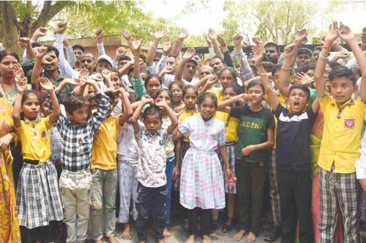
School children with their teachers and parents stage a protest to raise the issue of the recognition of private schools, at Rajya Shiksha Kendra in Bhopal on Tuesday.