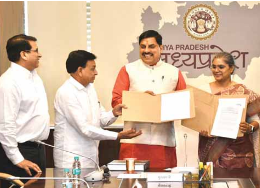
Madhya Pradesh Chief Minister Mohan Yadav witnesses MoUs signed between Madhya Pradesh State NITI Aayog and 4 organizations namely Antar Foundation, Pradaan, PHIA Foundation and UN Women at State Mantralaya in Bhopal on Tuesday.