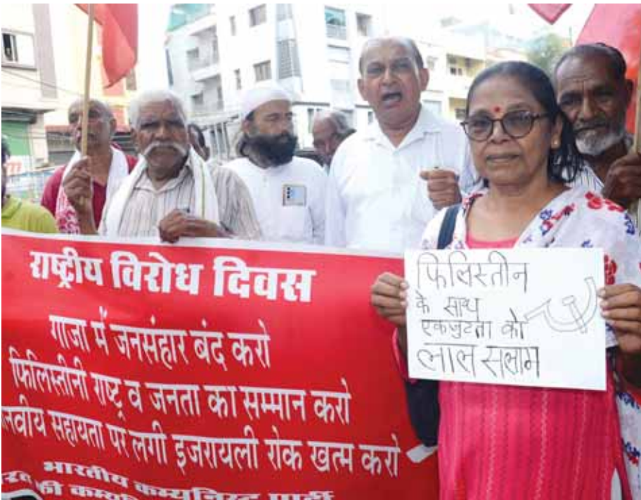
CPI (M) and CPI activists express solidarity towards Palestinians during a protest demanding to stop the brutal crackdown in Gaza, amid Israeli-Palestinian conflict, in Bhopal on Tuesday.

Bhopal: Chief Minister Dr. Mohan Yadav has emphasized the health benefits of yoga, stating that it helps eliminate diseases, brings balance to the body, and makes it free from disorders. He encouraged everyone to incorporate yoga into their daily routine to maintain overall well-being. Dr. Yadav made these remarks while reviewing preparations for the 11th International Yoga Day programme, scheduled to be held on June 21, during a meeting at Samatva Bhavan in his official residence on Tuesday. Highlighting the global recognition yoga has received, the Chief Minister credited Prime Minister Narendra Modi's efforts for elevating India's ancient wellness tradition to the international stage. "It is because of Prime Minister Modi's initiative that International Yoga Day is now celebrated across the world, not just in India," he said.