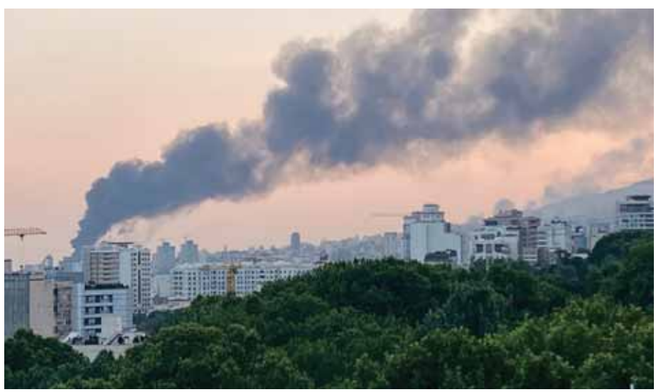
Smoke rises from the building of Iran's State-run television after an Israeli strike in Tehran, Iran, Monday

Earlier, the Israeli military had called for some 330,000 residents of a neighborhood in downtown Tehran to evacuate. Tehran is one of the largest cities in the Middle East, with around 10 million people,