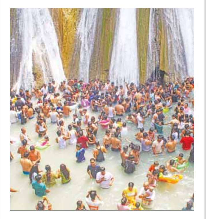
Tourists bathe at Kempty Falls in Mussoorie to beat the scorching heat.