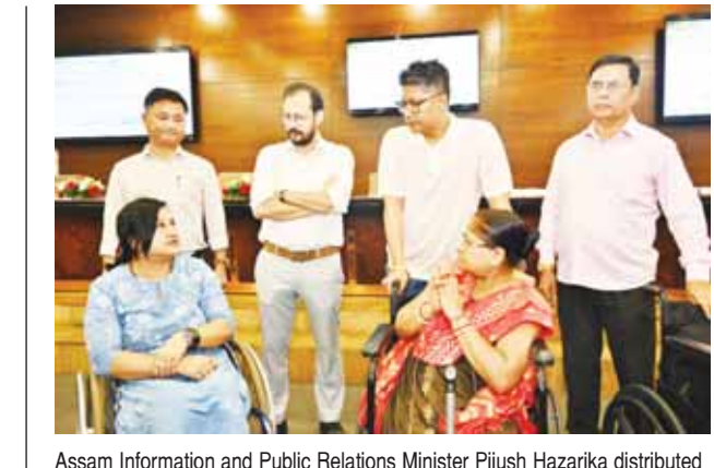
assistive devices like wheelchairs, hearing aids and smart canes to several beneficiaries at a programme organised by Department of Social Justice and

It was further directed to NHAI officials that the cleaning of the 3 culverts across the national highway and its connection with the Badshahpur drain must be completed on lar coordination between all