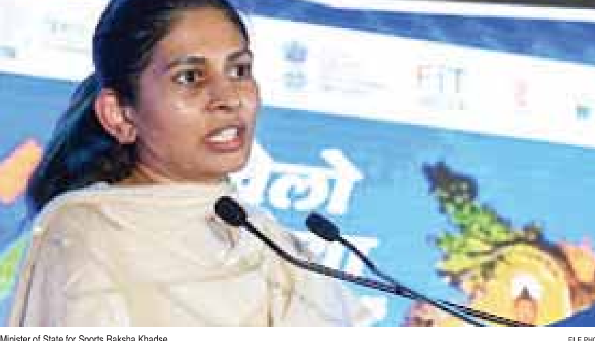
Minister of State for Sports Raksha Khadse

"Sports is also a way to deal with so many issues such as depression and even drug addiction. And keeping all this in mind, when you bring an event like the Olympics to the country, it becomes a galvanising force even socially. It creates a fitness movement of its own and enhances the output of a nation. It's a win-win for