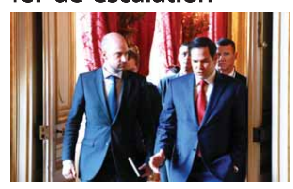
US Secretary of State Marco Rubio and French Foreign Minister Jean-Noel Barrot discussed the developing situation in the Middle East on Monday