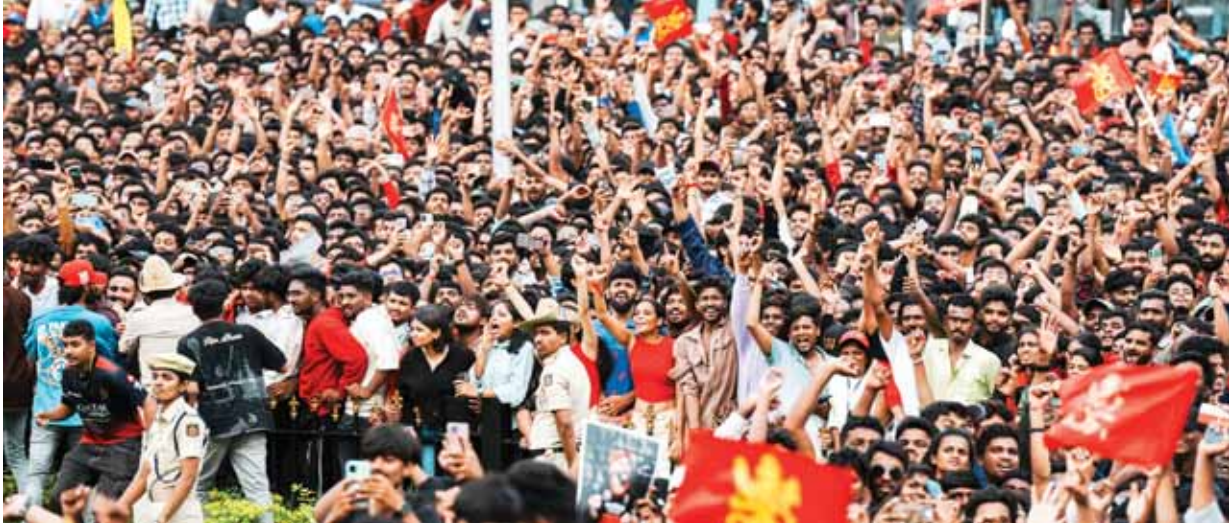
A crowd of fans gather in large numbers during Royal Challengers Bengaluru's felicitation ceremony after their winning the Indian Premier League (IPL) 2025, in front of Vidhana Soudha in Bengaluru on Wednesday

He also said that the stadium could only accommodate 35 thousand spectators. The chief minister announced a magisterial inquiry into the incident and a ₹10 lakh compensation to the kin of the deceased. The stampede took place when thousands