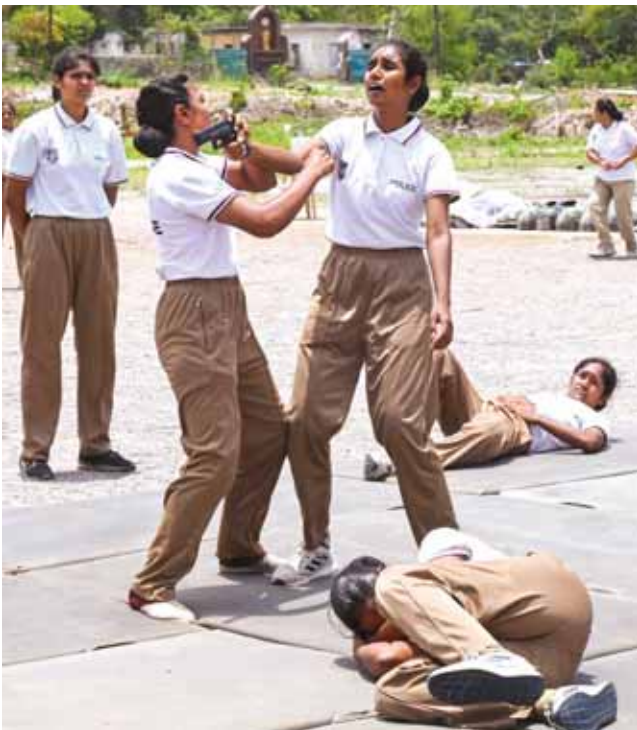
Members of the newly created women's police team demonstrate their skills in tackling criminals in Hyderabad.

Landslides triggered by heavy rains damaged roads across Nagaland, with crop destruction reported from some districts. In Kohima district, a major land sinking occurred near Kisama Heritage Village, while a major landslide was reported along the Kigwema-Mima-Chakhabama road. The road sinking at Phesama village near Kisama Heritage Village, where a 50m stretch of NH-2 has collapsed, cut off the key route between Nagaland and Manipur.