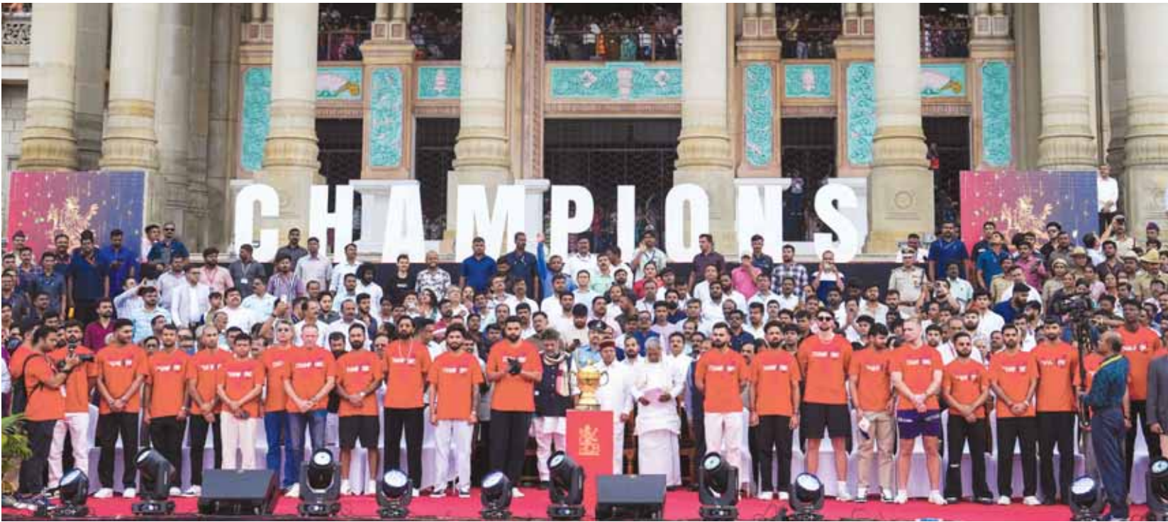
Karnataka Governor Thawar Chand Gehlot, Chief Minister Siddaramaiah and Deputy Chief Minister DK Shivakumar with Royal Challengers Bengaluru team members during a felicitation ceremony after winning the IPL 2025 at Vidhana Soudha in Bengaluru on Wednesday