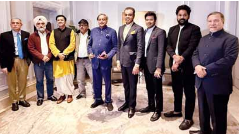
Members of the all-party delegation led by Congress MP Shashi Tharoor upon their arrival in Washington DC

"An all party delegation led by Dr @ShashiTharoor arrives in Washington DC. Over the next two days the delegation will be meeting members of the US Congress and administration, think tanks, media and policymakers to brief them on Operation Sindoor and India's strong stand against terrorism," the Indian Embassy said in a post on X.