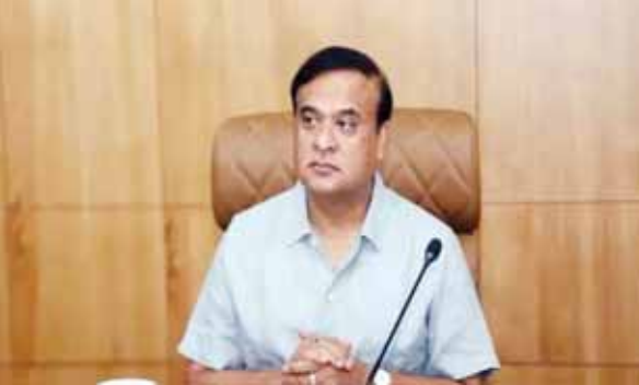
Assam Chief Minister Himanta Biswa Sarma

"At a time when nations today act decisively to neutralise nuclear threats, India's tragic inaction during the 1980s remains a cautionary tale of what could have been—and what wasn't," the chief minister said in a long post on X. He said that it was a 'missed moment' though the Research and Analysis Wing (RAW) had solid intelligence confirming Pakistan's uranium enrichment activities at the Kahuta facility.