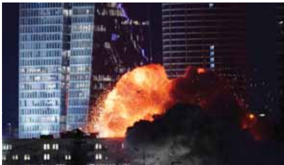
An explosion seen during a missile attack in Tel Aviv, Israel on Friday. Deir al-Balah (Gaza Strip)

year have denounced Trump and billionaire adviser Elon Musk. Protesters have called for Trump to be "dethroned" as they compare his actions to that of a king and not a democratically elected president. Why are they protesting on Saturday? The No Kings Day of Defiance has been organised to reject authoritarianism, billionaire-first politics and the militarization of the country's democracy, according to a statement by organisers. Organisers intend for the protests to counter the Army's 250th anniversary celebration - which Trump has ratcheted up to include a military parade, which is estimated to cost USD 25 million to USD 45 million that the Army expects to attract as many as 200,000 people. The event will feature hundreds of military vehicles and aircraft and thousands of soldiers. It also happens to be Trump's 79th birthday and Flag Day. "The flag doesn't belong to President Trump. It belongs to us," the "No Kings" website says. "On June 14th, we're showing up everywhere he isn't - to say no thrones, no crowns, no kings."