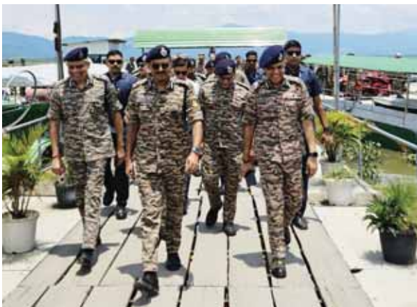
DG CRPF GP Singh undertook a comprehensive review of the security landscape in the jurisdiction of 32 Battalion at Loktak during his visit to Manipur

Unless swift action is taken to appoint the necessary officers and restore full administrative capacity, the state risks deeper governance challenges in the weeks to come.