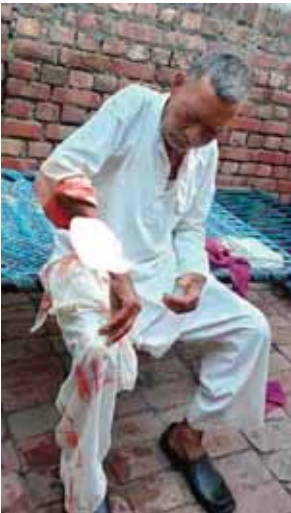
As he screamed, other villagers rushed in and the crocodile