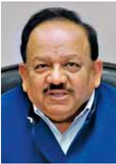
DR HARSH VARDHAN, Senior BJP leader, former Union Health Minister, Environment, Science and Technology, Earth Sciences.

To combat the scourge of household air pollution, Pradhan Mantri Ujjwala Yojana (PMUY) was launched in May 2016. PMUY focused on providing deposit free LPG connections to adult women from poor households,