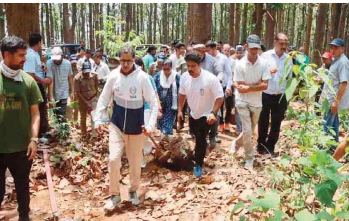
Green activists registering protest at alleged attempt to grab Forest land in Khalanga area of Dehradun on Saturday.

The chief of army staff banner was awarded to Keren Company for standing overall first amongst 12 companies for the Spring Term 2025.