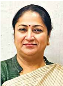
REKHA GUPTA Chief Minister of Delhi

Youth and farmers have been the new vanguard of progress under the leadership of Shri Narendra Modi. Empowering the Amrit Peedhi, India’s youth, has been a cornerstone of this Government.