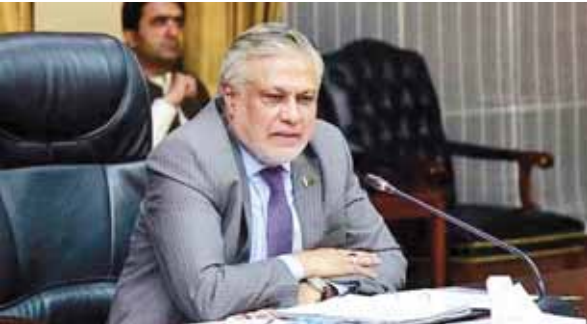
Ishaq Dar, Pakistan's deputy prime minister, made the admission on TV news show FILE PHOTO

"Unfortunately, India once again launched missile strikes at 2:30 AM. They attacked the