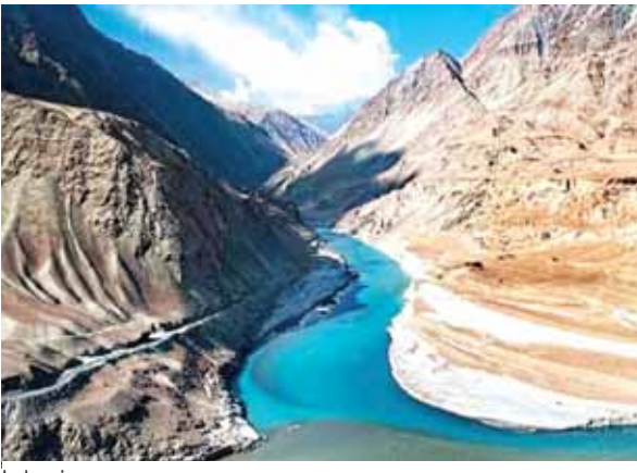
Indus river FILE PHOTO

According to the proposed plan, the 113 km long canal is expected to link the Chenab River to the Ravi-Beas-Sutlej system, connecting with 13 existing canal structures and potentially feeding into the Indira Gandhi Canal to address water scarcity in other North Indian States. The Jal Shakti Ministry is already working on infrastructure development on a war footing to implement the decision in a span of next three years. The aim is to ensure that not a single drop of water meant for Pakistan goes to waste.