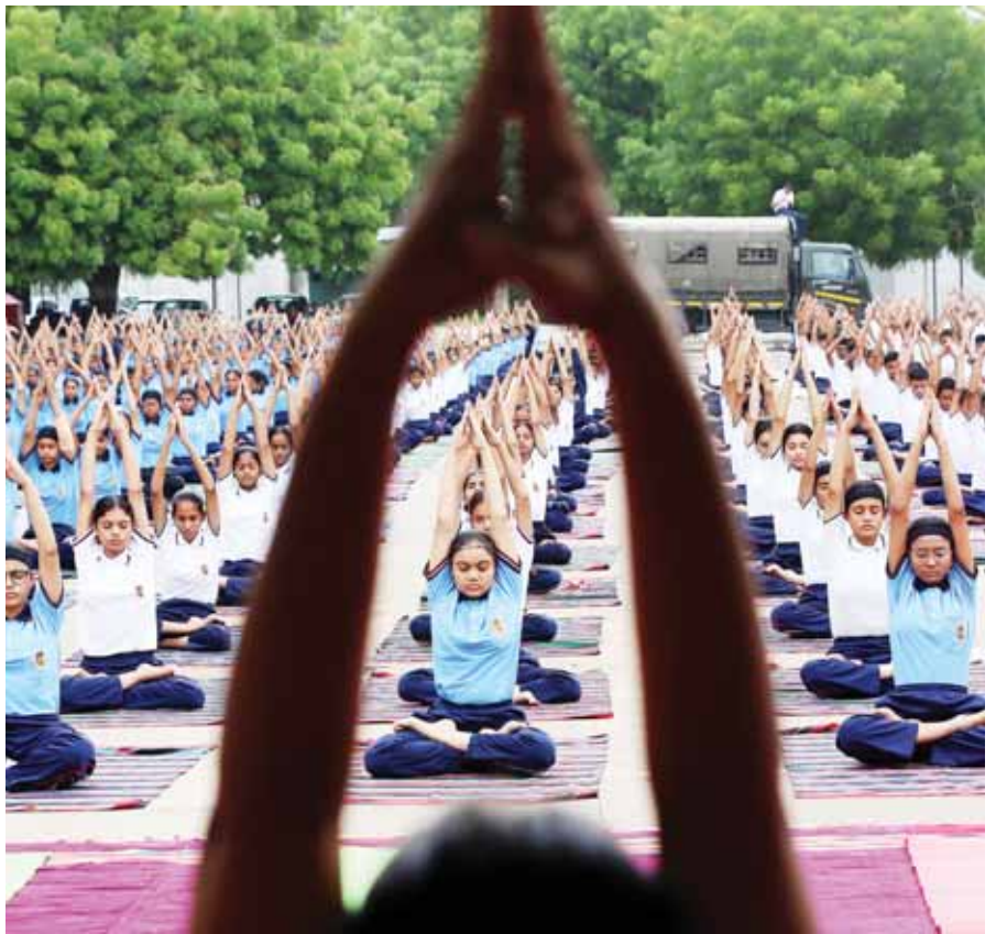
National Cadet Corps (NCC) cadets and others practice yoga ahead of the International Day of Yoga, at NCC headquarters, in Ahmedabad, Gujarat

As per the report, the price of the hot-air balloon rides will be decided by the firm, however, DDA has directed that it be kept reasonable.