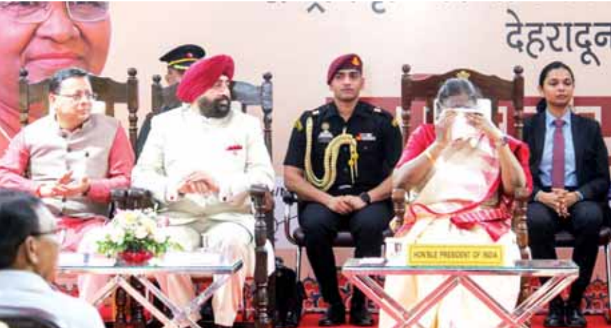
President Droupadi Murmu gets emotional as a group of visually impaired children sing a song to wish her on her 67th birthday at NIEPVD in Dehradun