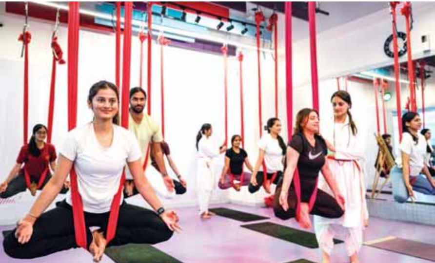
Youngsters perform aerial yoga on the eve of the International Day of Yoga in Mumbai

Additionally, the ICCR is also hosting ‘Yoga Bandhan’, a signature event of IDY 2025, where 17 yoga gurus and practitioners from 15 countries,