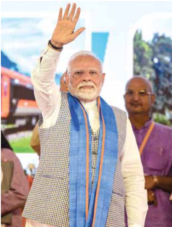
Prime Minister Narendra Modi greets the gathering during a public meeting, in Siwan district, Friday

Modi had on Tuesday declined Trump's invitation to visit the US while returning from Canada, Foreign Secretary Vikram Misri said in a statement on the Modi-Trump phone call. According to Misri's statement, Modi said he could not accept the invitation due to a pre-existing schedule, and invited Trump to