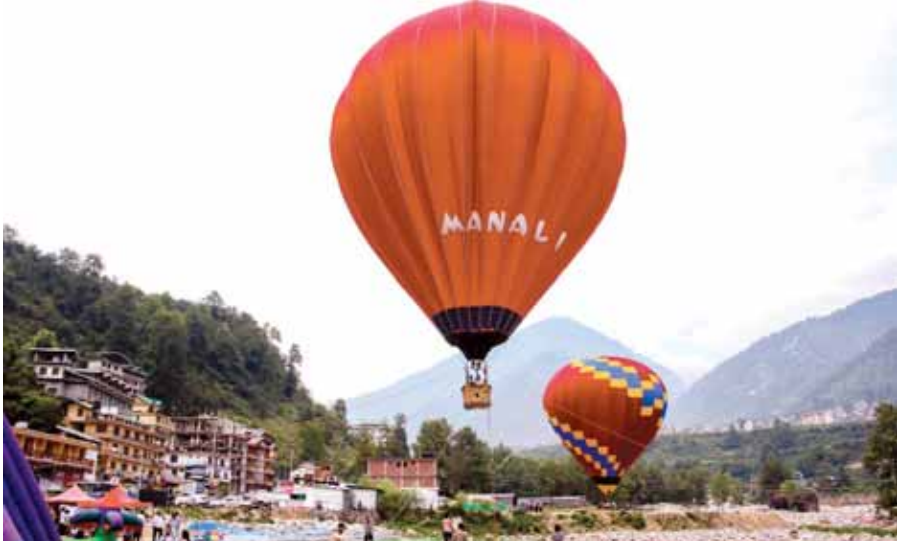
Tourists ride a hot air balloon, in Manali, Friday