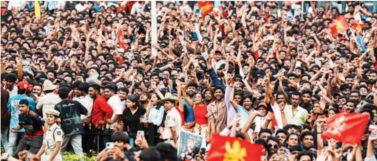
A crowd of fans gather in large numbers during Royal Challengers Bengaluru's felicitation ceremony after their winning the Indian Premier League (IPL) 2025, in front of Vidhana Soudha in Bengaluru on Wednesday

He also said that the stadium could only accommodate 35 thousand spectators. The chief minister announced a magisterial inquiry into the incident and a ₹10 lakh compensation to the kin of the deceased. The stampede took place when thousands of fans attempted to enter the stadium