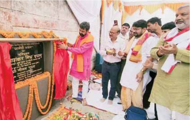
UP minister Dr Dayashankar Mishra 'Dayalu' laying foundation stone of pharmacy building at Government Ayurveda College in Varanasi