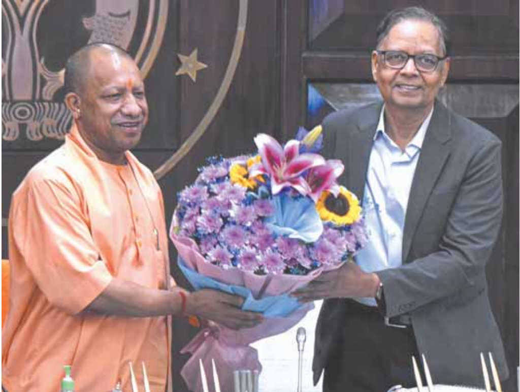
Chief Minister Yogi Adityanath with 16th Finance Commission Chairman Arvind Panagariya during a meeting at Lok Bhavan in Lucknow on Wednesday

Sharing details of UP's key demands, Panagariya disclosed that the state has proposed changes to the devolution formula - suggesting a reduction in the weightage for income distance (from 45 per cent to 30 per cent), geographical area (15 per cent to 10 per cent), demographic performance (12.5 per cent to 7.5 per cent) and forest cover (10 per cent to 5 per cent), while seeking increases in the weightage for population (15 per cent to 22.5 per cent) and tax collection effort (2.5 per cent to 10 per cent).