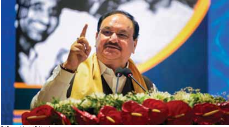
BJP president JP Nadda

At a press conference, BJP national spokesperson Sudhanshu Trivedi said Rahul Gandhi’s remarks reflect a “sick and dangerous” mindset and added the Congress leader had surpassed even Pakistan’s army chief, prime minister and the terrorist masterminds based there in speaking in support of their country.