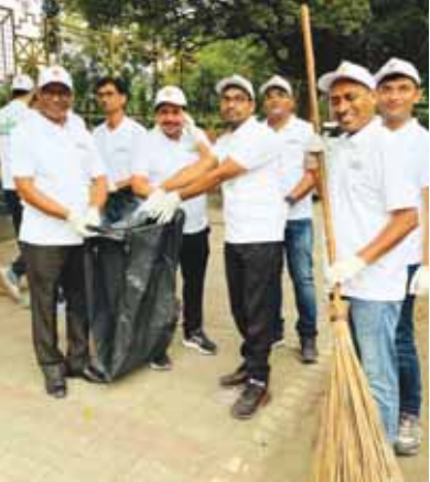
BoB officials carrying out a cleanliness drive