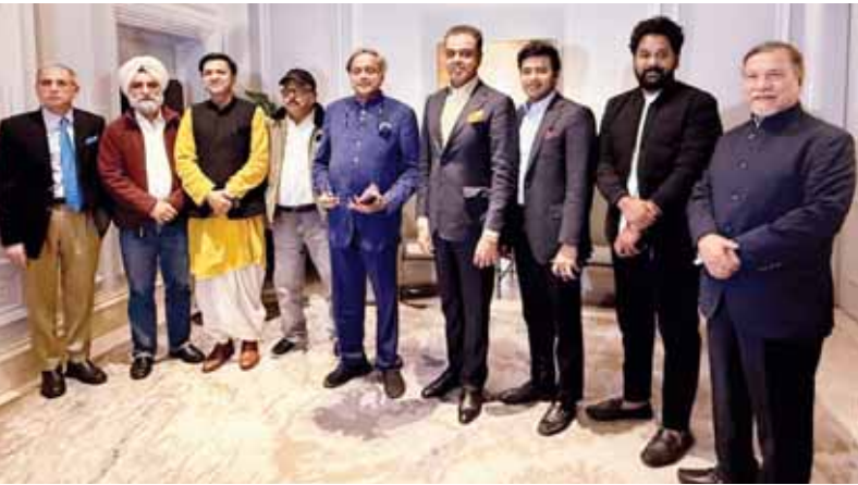
Members of the all-party delegation led by Congress MP Shashi Tharoor upon their arrival in Washington DC

"An all party delegation led by Dr @ShashiTharoor arrives in Washington DC. Over the next two days the delegation will be meeting members of the US Congress and administration, think tanks, media and policymakers to brief them on Operation Sindoor and India's strong stand against terrorism," the Indian Embassy said in a post on X.