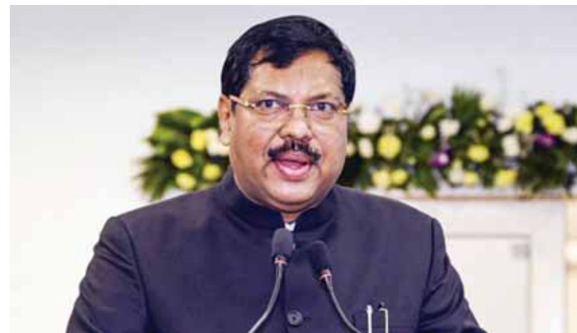
Chief Justice of India BR Gavai

“However, the path to rebuilding this trust lies in the swift, decisive, and transparent action taken to address and resolve these issues. In India, when such instances have come to light, the Supreme Court has consistently taken immediate and appro-