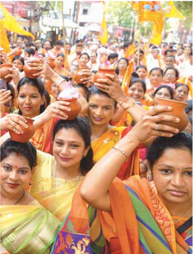
Women of the Maheshwari community carry 'kalash' filled with Ganga river water to offer to Baba Kashi Vishwanath during a procession on the occasion of Mahesh Navami in Varanasi on Wednesday.