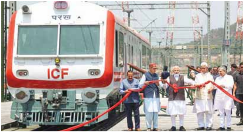
PM Narendra Modi with Minister for Railways Ashwini Vaishnaw, MoS Jitendra Singh, J and K LG Manoj Sinha and CM Omar Abdullah during the inauguration of the Chenab rail bridge

In a resolute address, marking the one-month anniversary of Operation Sindoor, Prime Minister Narendra Modi Friday sent a stern message to Pakistan, from the base camp of Mata Vaishno Devi Shrine, declaring that Operation Sindoor will keep reminding Pakistan of its “humiliating defeat”. Addressing an impressive gathering of people in Katra after inaugurating the world’s highest railway arch bridge and flagging off the maiden run of Vande Bharat Express, Prime Minister Modi emphasised the decisive blow delivered by India on the night of May 6, 2025, targeting terror camps across Pakistan and Pakistan-occupied Kashmir (PoK). The operation, executed with precision, dismantled decades-old terror infrastructure within minutes, catching Pakistan’s military and terror networks off guard. PM also condemned Pakistan’s retaliation