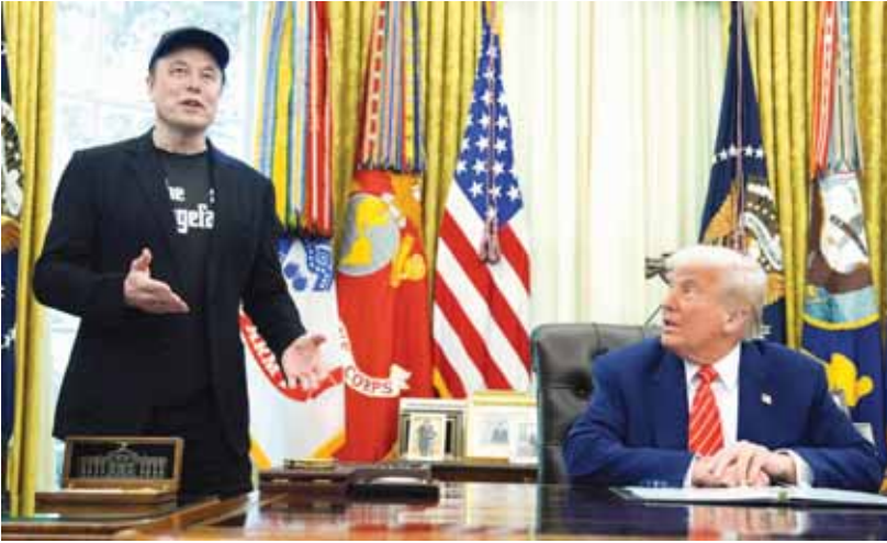
Elon Musk speaks during a news conference with President Donald Trump in the Oval Office of the White House

President Donald Trump on Thursday threatened to cut Elon Musk’s Government contracts as their fractured alliance rapidly escalated into a public feud with Trump suggesting he would use the US Government to hurt his fellow billionaire financially. The spectacular blow-up between the president of the United States and the world’s richest man played out on their respective social media platforms after Trump first broached the topic in a White House meeting with Germany’s new leader. The rancorous breakup happened less than a week after they appeared together at the White House and Trump thanked Musk for his brief but tumultuous time in the US Government. Trump had largely remained silent as Musk stewed over the last few days on his social media platform X, condemning the president’s signature tax cuts and spending bill. But Trump clapped back Thursday in the Oval Office, lamented their frayed relationship and said he was “very disappointed in Musk”. Musk responded on social media in real time. Trump ratcheted up the stakes when he turned to his own social media network, Truth Social, and threatened to use the US Government to hurt Musk’s bottom line with his internet company Starlink and rocket company SpaceX.