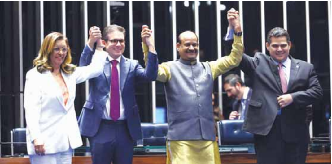
Lok Sabha Speaker Om Birla at closing ceremony of 11th BRICS Parliamentary Forum in Brasilia, Brazil

The BRICS Parliamentary Forum, which includes China and Iran, condemned the terrorist attack in Pahalgam and resolved to fight terrorism together on Friday. Lok Sabha Speaker Om Birla, who led the Indian parliamentary delegation to the forum meeting in Brasilia, made a strong case for cutting off financial assistance to terrorist organisations, sharing intelligence, preventing misuse of modern technologies and cooperating in investigation and judicial processes. "The joint declaration strongly condemned the recent terrorist attack in Pahalgam, India, and it was agreed that the parliaments of all BRICS countries would work together united against terrorism," a statement from the Lok Sabha Secretariat said.