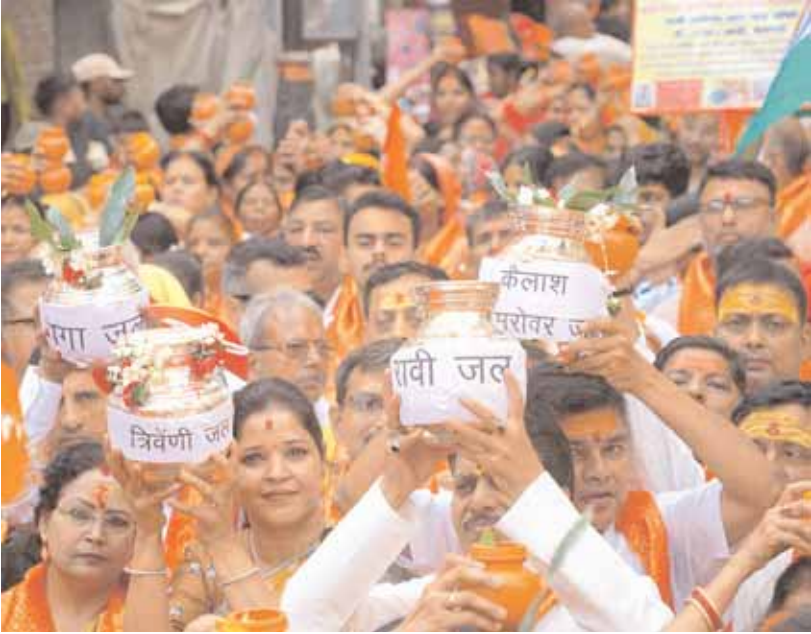
Devotees carry pots filled with holy waters from various rivers during a 'Kalash Shobha Yatra' on the occasion of Nirjala Ekadashi in Varanasi on Friday.