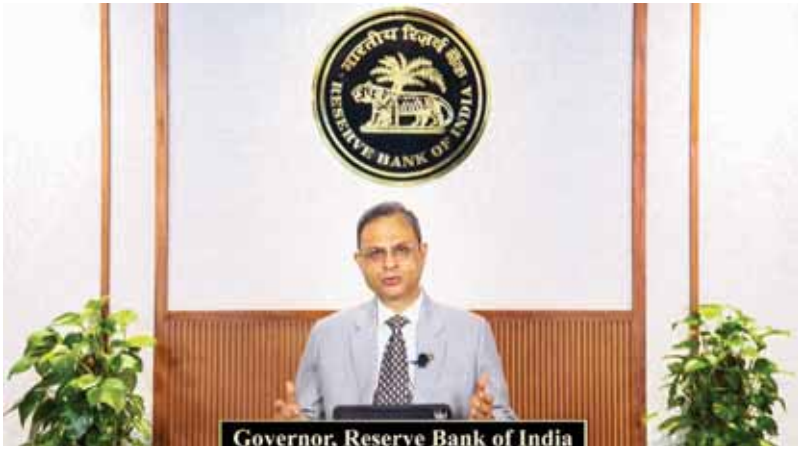
RBI Governor Sanjay Malhotra gestures while delivering the Monetary Policy statement in Mumbai

Reserve Bank of India (RBI) Governor Sanjay Malhotra on Friday said there is very little scope for rate cut in the current circumstances after the central bank reduced the policy rate by 50 basis points taking the total reduction to 100 bps since February. Addressing media after unveiling bi-monthly monetary policy, Malhotra said, future monetary policy actions will depend upon incoming data. “There is now very limited space for the monetary policy, actually, given the current circumstances...Growth (projection) is about 6.5 per cent, inflation, we are projecting at 3.7 per cent for this year and above 4 per cent for the next next year...If these were to play out, there is very limited space,” he said. “We will continue to monitor the