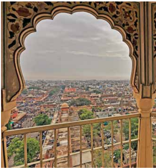
Walled city of Jaipur on a cloudy day.

It highlights the dangers of allowing celebrations to go ahead without adequate safety checks, co-ordination, and crowd management. What happened on June 4 was not an accident — it was a preventable disaster born out of administrative chaos and competing egos. No public celebration should ever proceed without thorough planning, clear communication, and above all, respect for human life. The victory of a cricket team is meant to unite, uplift, and inspire — not become a day of mourning. The hope now is that lessons are learnt, responsibilities are fixed, and that never again will joy turn so swiftly into sorrow.