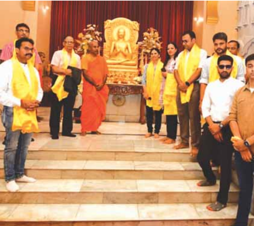
Finance Commission Chairman Dr Arvind Panagariya and others visiting Sarnath in Varanasi on Friday.

After this, the team members reached Banarasi Silk Centre, Panaya, an ODOF centre located at Chowkghat and got detailed information about the entire process of making Banarasi saree. During