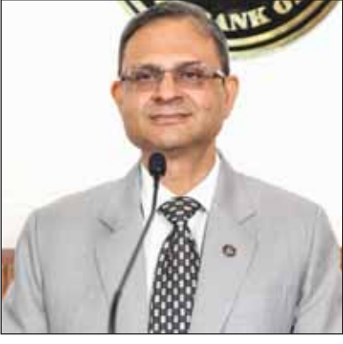
RBI Governor Sanjay Malhotra

The Reserve Bank of India (RBI) cut interest rates by more than expected 50 basis points on Friday, a third consecutive reduction, and unexpectedly reduced the cash reserve ratio for banks to provide a major liquidity fillip to support the economy amid geopolitical and tariff headwinds. The RBI’s six-member monetary policy committee, headed by Governor Sanjay Malhotra and consisting of three external members, voted five to one to lower the benchmark repurchase or repo rate by 50 basis points to 5.5 per cent. It also cut the cash reserve ratio by 100 basis points to 3 per cent, adding ₹2.5 lakh crore to already surplus liquidity in the banking system. With the latest reduction, RBI has now cut interest rates by a total of 100 basis points in 2025, starting with a quarter-point reduction in February — the first cut since May 2020 — and another similar-sized cut in April.