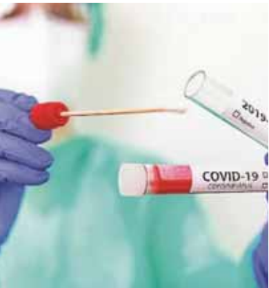
PIONEER NEWS SERVICE ■ New Delhi

India's active Covid case tally crossed the 5,000 mark with Kerala remaining the most affected State followed by Gujarat, West Bengal and Delhi, according to the Union Health Ministry data released on Friday. In view of the increase in cases, the Centre is conducting mock drills to check facility-level preparedness for COVID-19. All States have been instructed to ensure availability of oxygen, isolation beds, ventilators, and essential medicines in view of rising cases of Covid. There are 5,364 active cases in India and four fresh deaths have been reported in the last 24 hours. Official sources have maintained that most cases are mild and managed under home care. Since January this year, 55 deaths have been reported in the country. There were a total of 257 active patients in the country on May 22. A series of technical review meetings were held on June 2 and 3 under chairpersonship of Dr Sunita Sharma, Director General of Health Services (DGHS) with representatives of Disaster Management Cell, Emergency Management Response (EMR) Cell, National Centre for Disease Control