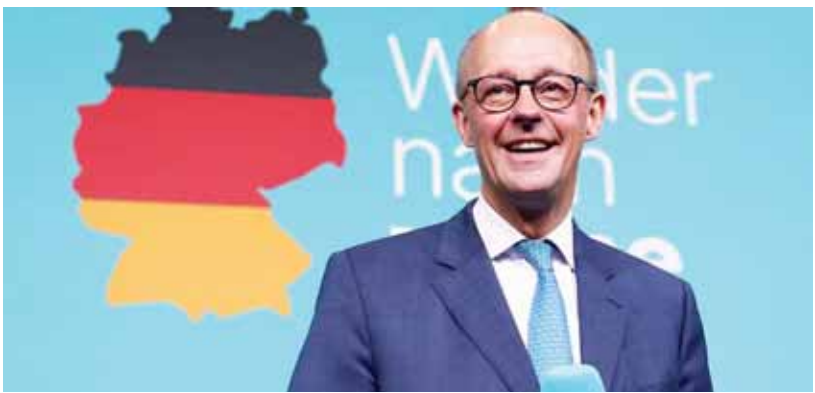
German Chancellor Friedrich Merz

Thursday's White House meeting marked the first time the two sat down in person. Merz, who became chancellor in May, avoided the kind of confrontations in the Oval Office that have tripped up other world leaders, including Ukraine's Volodymyr Zelenskyy and South Africa's Cyril Ramaphosa. The two leaders opened