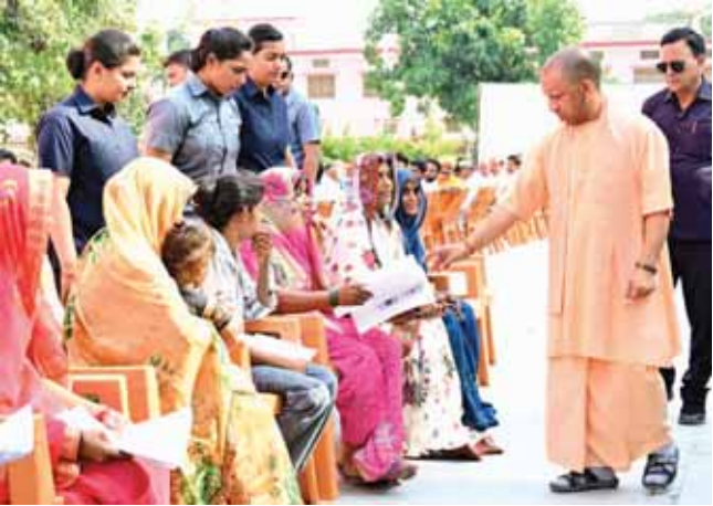
Chief Minister Yogi Adityanath during the Janta Darshan in Gorakhpur.

ing prayers to Shivavtar Guru Gorakhnath and then visited the samadhi of his revered guru, Brahmalin Mahant Avedyanath, to pay his respects. As part of his regular practice, he visited the temple cowshed (gaushala), where he affectionately called the cows by their names. Familiar with his voice, many of the cows came running to him. The chief minister lovingly caressed them, gently stroked their foreheads, and fed them jaggery with his own hands, displaying his deep bond and compassion for the animals. Earlier in the morning, a group of young martial arts students, mostly girls, came to meet the chief minister at the Gorakhnath temple to wish him a belated happy birthday. The children greeted him with a rose and warm wishes, saying "Happy Birthday, Maharaj ji!" The children also presented a memento to the chief minister and performed a few martial arts steps to express their admiration. The CM lovingly accepted their wishes, interacted with them about their training and studies, and posed for photos with them. Although the chief minister does not celebrate his birthday since embracing the path of 'sanyas', people from all walks of life continue to mark the occasion with joy. On Thursday, his 53rd birthday was celebrated across the state through various programmes organised by individuals and social groups.