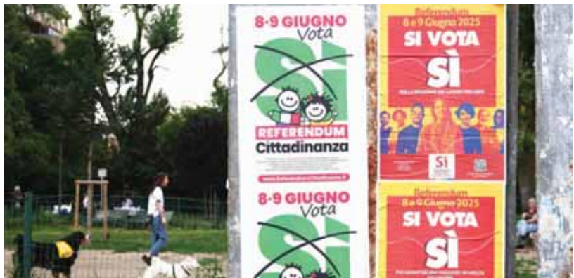
Banners in favour of five abrogative popular referendums on employment and Italian citizenship

Italians vote over two days starting Sunday on referendums that would make it easier for children born in Italy to foreigners to obtain citizenship, and on providing more job protections. But apparent low public awareness risks rendering the vote invalid if turnout is not high enough. Campaigners for the change in the citizenship law say it will help second-generation Italians born in the country to non-European Union parents better integrate into a culture they already see as theirs. Italian singer Ghali, who was born in Milan to Tunisian parents, urged people to vote in an online post, noting that the referendum risks failure if at least 50per cent plus one of eligible voters don't turn out. "I was born here, I always lived here, but I only received citizenship at the age of 18," Ghali said, urging a yes vote to reduce the residency requirement from 10 to five years. The new rules, if passed, could affect about 2.5 million foreign nationals who still struggle to be recognised as citizens. The measures were proposed by Italy's main union and left-wing opposition parties. Premier Giorgia Meloni has said she would show up at the polls but not cast a ballot — an action widely criticised by the left as antidemocratic, since it will not help