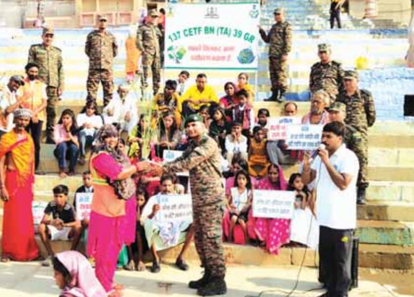
A woman sanitation worker being felicitated at Prahlad Ghat in Varanasi on Sunday.