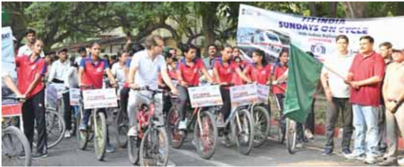
Scouts & Guides, volunteers of St John's Ambulance Brigade, Civil Defence members, SAI coaches, and players.

The rally was organised jointly by BLW Administration, BLW Sports Association, Sports Authority of India (SAI), and the Public Relations Department. It saw enthusiastic participation from BLW officials, employees, RPF personnel, Bharat