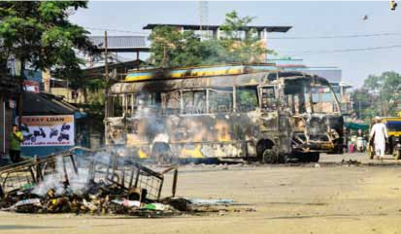
Charred remains of a bus used for transporting central forces, which was set on fire by a mob in Imphal East district, Manipur