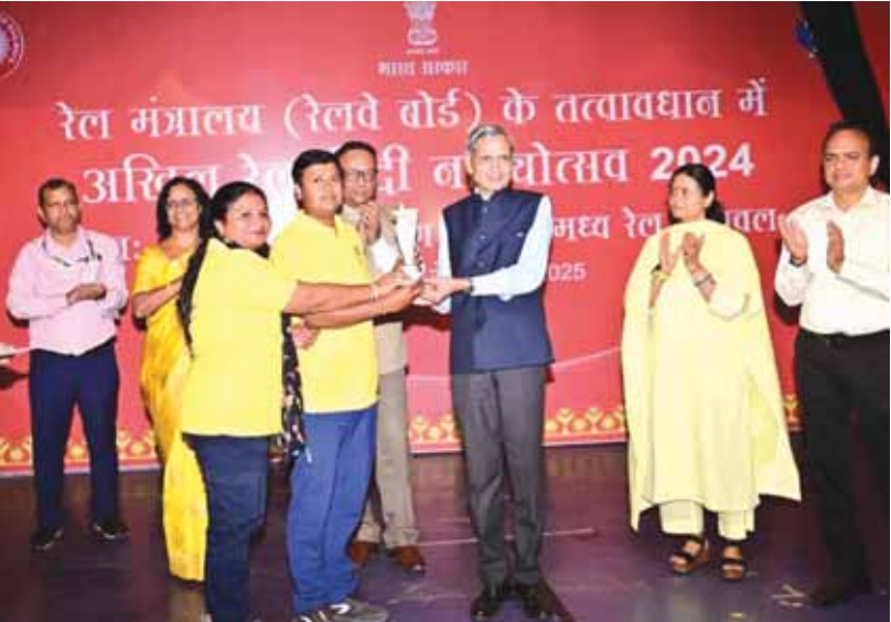
NER (Varanasi Division) team receiving an award at ZRTI Bhusaval recently.