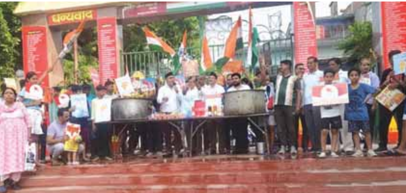
RSS activists celebrate Hindu Empire Day at Parashuram Vatika on Sunday.