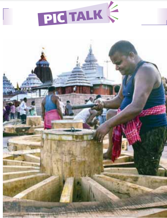
Carpenter gives final shape to the wheel of the chariot of Lord Jagannath, Balabhadra and Devi Subhadra ahead of the Rath Yatra festival, in Puri.

(The author is a spiritual coach. Views expressed are personal)