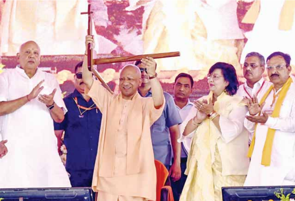
Chief Minister Yogi Adityanath during an event organised as part of the 'Krishi Sankalp Abhiyan-2025' in Auraiya.

The chief minister emphasised the government's commitment to transforming the future of farmers. "Before 2017, farmers faced distress with rising suicides and unpaid sugarcane dues, and lacked procurement centres for key crops like maize, oilseeds, pulses, potatoes, millet, sorghum, paddy and wheat. One of the government's first major steps after assuming office in 2017 was waiving Rs 36,000 crore in loans for 86 lakh farmers. Irrigation coverage was expanded significantly under the PM