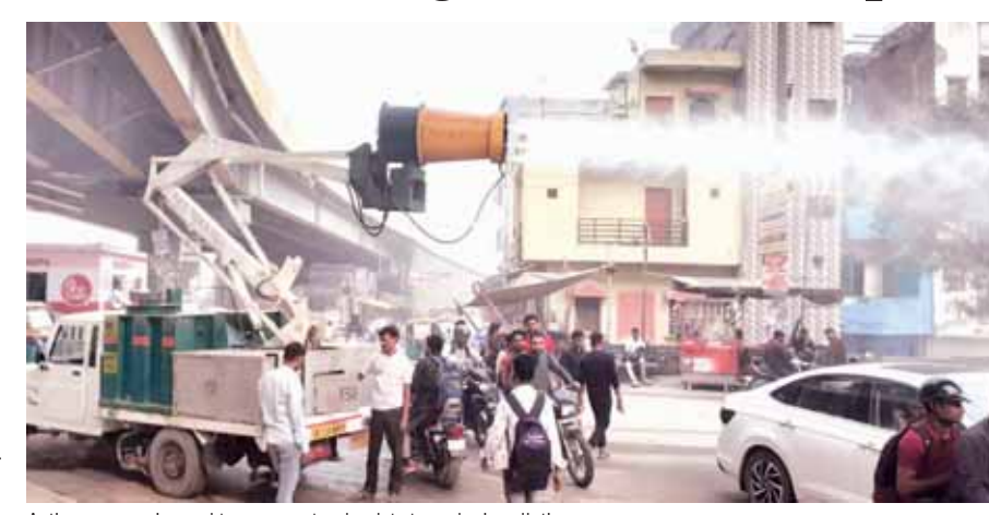
Anti-smog gun is used to spray water droplets to curb air pollution

Vehicle owners found violating the regulation will face strict penalties with a fine of ₹10,000 for four-wheelers and