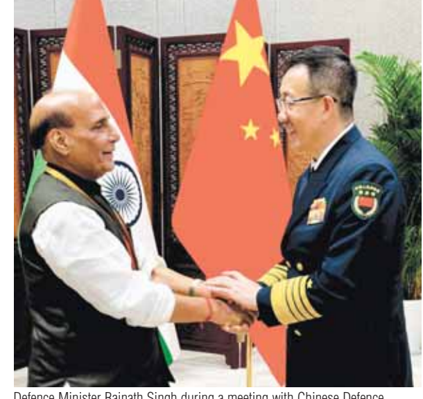
Defence Minister Rajnath Singh during a meeting with Chinese Defence Minister Admiral Dong Jun on the sidelines of the SCO Defence Ministers

Rajnath Singh said both the countries should solve the "complex issues" under a structured roadmap comprising steps to de-escalate tensions along the frontiers and rejuvenate the existing mechanism to demarcate the borders. He emphasised the need to create "good neighbourly conditions" to achieve the best mutual benefits and called for "taking action on