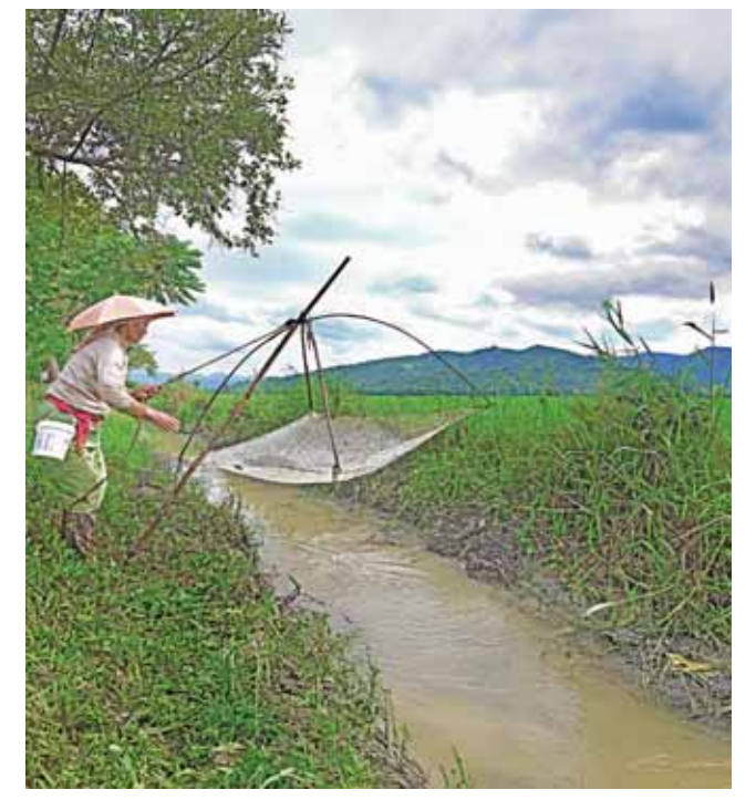
A glimpse of traditional fishing practices in Manipur, where sustainable methods continue to thrive.