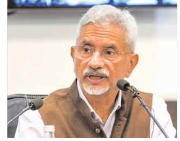
External Affairs Minister S Jaishankar addressing a press conference in New Delhi on Friday

At a conference of SCO, Singh demanded inclusion of the terror attack in the com-