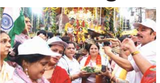
Devotees offering prayers to Lord Jagannath in Varanasi on Friday.

Rath Yatra crossing. Lord Jagannath will stay on the chariot till the wee hours on Monday, prior to the return of idols to Jagannath temple at Assi. The idols were installed at the chaior amidst chanting of traditional mantras by the priests. The idols were decorat-