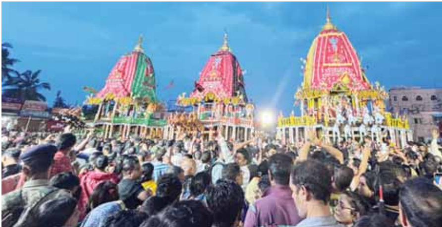
People gather near the chariots of Lord Jagannath, Lord Balabhadra and Goddess Subhadra during the annual 'Rath Yatra' festival celebration, in Puri, Odisha, Sunday