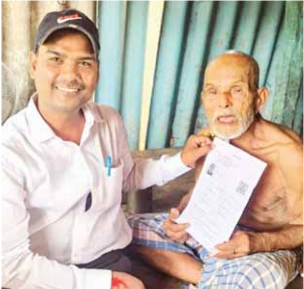
BLO hands over an enumeration form to an elderly voter as part of the special intensive revision of electoral rolls, ahead of the Bihar Assembly elections

The Census is a two-phase exercise — in phase one ie Houselisting Operation (HLO), the housing conditions, assets and amenities of each