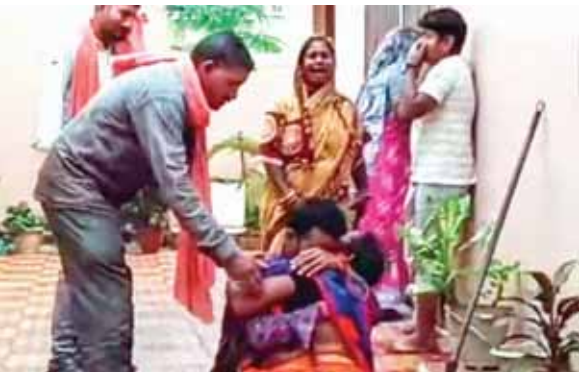
Family members of a victim mourn at a hospital after a stampede near Shree Gundicha Temple in Puri, Odisha

Condoling the loss of lives in the stampede near Gundicha Temple in Odisha's Puri, Congress leader Rahul Gandhi on Sunday said protecting lives is paramount and any lapse in this responsibility is unacceptable. He said the tragedy is a serious warning that security arrangements and crowd management for such big events should be taken seriously and must be reviewed. "The stampede during the Rath Yatra in Puri is extremely saddening. My deepest condolences to the bereaved families, and I hope for the speedy recovery of the injured devotees," the Leader of Opposition in the Lok Sabha said in a social media post in Hindi. He appealed to the Odisha government to speed up the relief work and urged Congress workers to help in