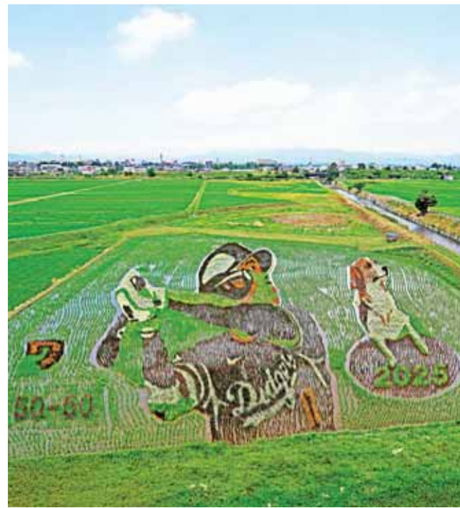
Stunning rice paddy art in Oshu, Japan, celebrates hometown hero Shohei Ohtani and his beloved dog Decoy.