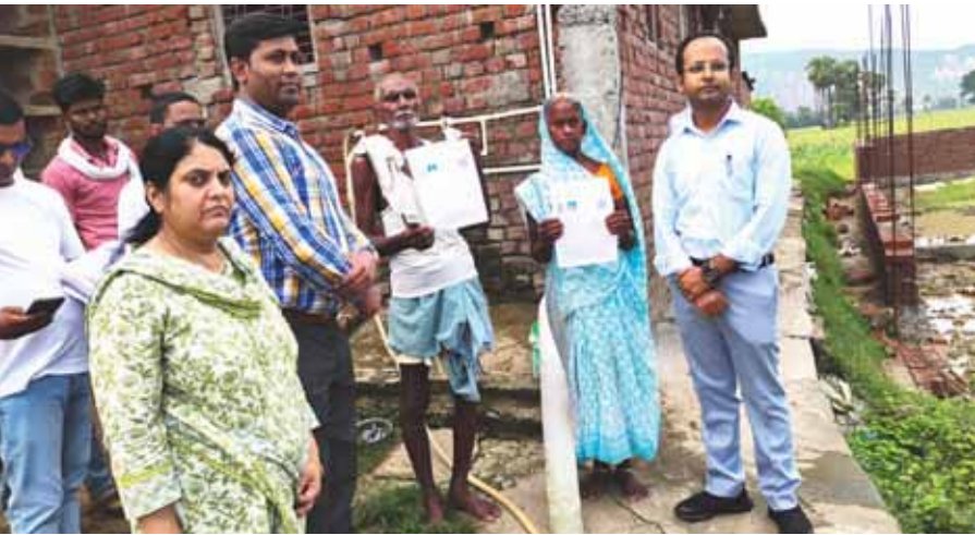
District Election Officer cum District Officer Nawada and his team hand over counting forms to voters ahead of the Bihar Assembly elections