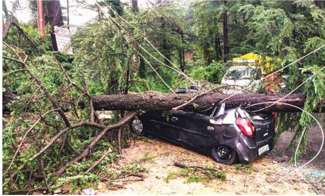
A vehicle crushed under an uprooted tree after heavy rainfall in Shimla on Sunday

In 2023, massive damage was caused by heavy rains in the state when the MeT office issued a red alert in the months of July and August. Over 550 people had died in the worst ever monsoon disaster in Himachal Pradesh. The train service on the Shimla-Kalka railway line — a UNESCO world heritage — was disrupted on Sunday as boulders and trees fell on the track near Solan's Koti area after heavy rain, the officials said. The repair work is underway, they added. The first train that was scheduled to arrive in the morning is stuck at Koti railway station, while other trains have been halted at Gumman and Kalka. Videos of passengers, waiting for hours, expressing their anger are also surfacing online. Stones, trees and debris have fallen at various places not only in Koti but also till Shimla. A bridge on the road leading to Himuda Complex near Truck Union in Barotiwala industrial area of Solan district has been washed away and the road to Himuda Complex Mandhala and Baggwala has been closed. Bald River in the Baddi area of the district is on surge and taking a fierce form near Jhadmajri. A threat of damage in the surrounding areas looms as continuous rains are going on for hours. Reports of water upto four feet entering over 20 houses in