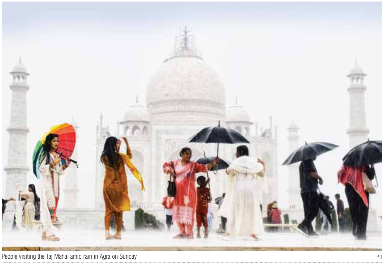
People visiting the Taj Mahal amid rain in Agra on Sunday