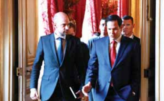
US Secretary of State Marco Rubio and French Foreign Minister Jean-Noel Barrot discussed the developing situation in the Middle East on Monday