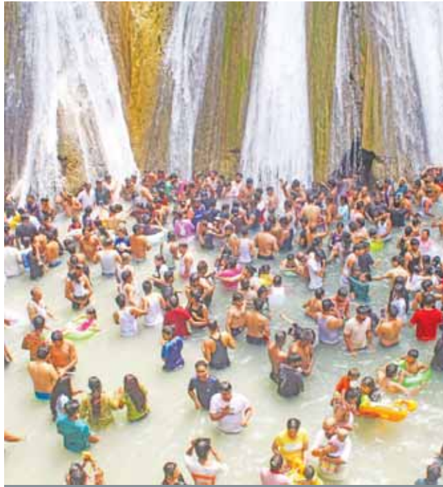
Tourists bathe at Kemptly Falls in Mussoorie to beat the scorching heat.

(The writer is a popular columnist. Views are personal)