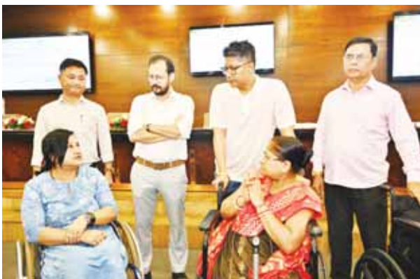
Assam Information and Public Relations Minister Pijush Hazarika distributed assistive devices like wheelchairs, hearing aids and smart canes to several beneficiaries at a programme organised by Department of Social Justice and Empowerment Assam

It was further directed to NHAI officials that the cleaning of the 3 culverts across the national highway and its connection with the Badshahpur drain must be completed on priority.