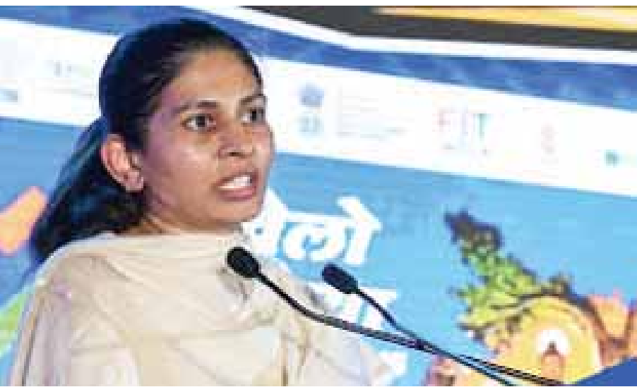
Minister of State for Sports Raksha Khadse

India's bid to host the 2036 Olympics is not merely an attempt to make a statement internationally but also a well thought out plan to create world-class infrastructure, bolster the economy and tackle pressing social issues affecting the country's youth, says Minister of State for Sports Raksha Khadse. In an exclusive interview, the 38-year-old three-time Lok Sabha MP from Maharashtra's Raver constituency, dismissed criticism from some quarters that the country needs to focus more on becoming a sporting powerhouse before aiming for something as expensive as hosting the Olympics. "Preparing to host events like the 2036 Olympics or the 2030 Commonwealth Games is about creating world-class infrastructure, economic investment and legacy systems that directly benefit athlete development," she asserted in the interaction at her office here. "Sports is also a way to deal with so many issues such as depression and even drug