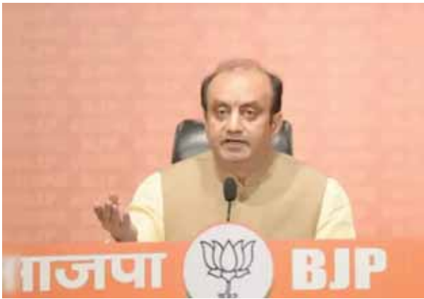
BJP national spokesperson Sudhanshu Trivedi

Lambasting the Congress for "misleading" people with false claims, BJP national spokesperson Sudhanshu Trivedi alleged that the prime