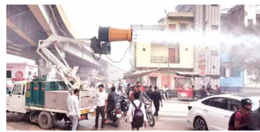
Anti-smog gun is used to spray water droplets to curb air pollution

Vehicle owners found violating the regulation will face strict penalties with a fine of ₹10,000 for four-wheelers and