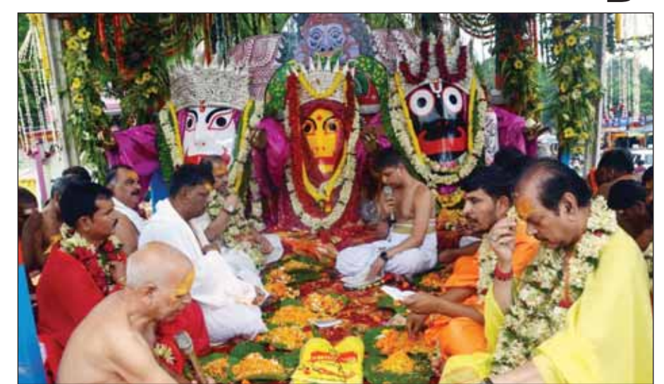
Priests perform rituals during Lord Jagannath Rath Yatra at Jagannath Temple in Ranchi on Friday.