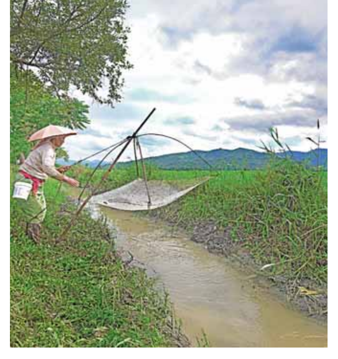
A glimpse of traditional fishing practices in Manipur, where sustainable methods continue to thrive.