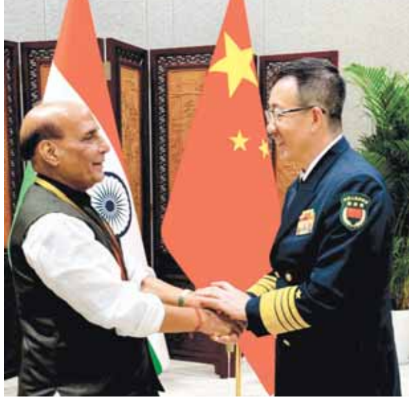
Defence Minister Rajnath Singh during a meeting with Chinese Defence Minister Admiral Dong Jun on the sidelines of the SCO Defence Ministers

Rajnath Singh said both the countries should solve the "complex issues" under a structured roadmap comprising steps to de-escalate tensions along the frontiers and rejuvenate the existing mechanism to demarcate the borders. He emphasised the need to create "good neighbourly conditions" to achieve the best mutual benefits and called for "taking action on