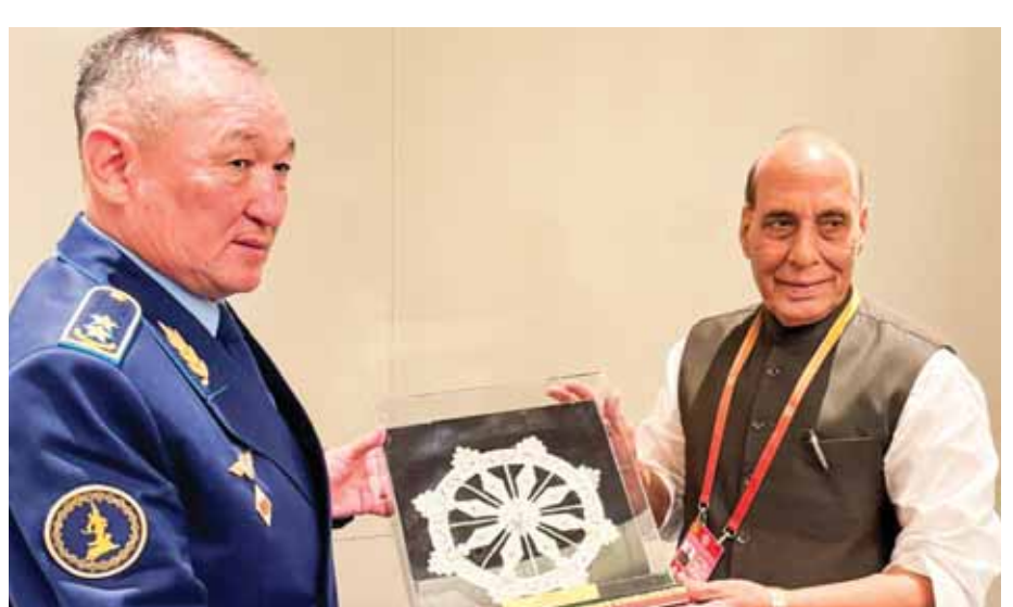
Defence Minister Rajnath Singh meeting Kazakhstan Defence Minister Lieutenant General Dauren Kosanov on sidelines of the SCO Defence Ministers Meeting in Qingdao

Operation Sindoor last month. Rajnath Singh and Belousov held in-depth discussions on a range of subjects covering current geopolitical situations, cross-border terrorism and Indo-Russian defence cooper-