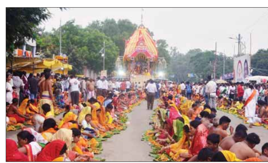
Devotees accept 'Prasad' during Lord Jagannath Rath Yatra at Jagannath Temple in Ranchi on Friday.

The Rath Yatra of Lord Jagannath in the capital Ranchi (Jagannath Rath