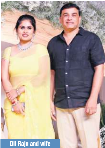
Dil Raju and wife