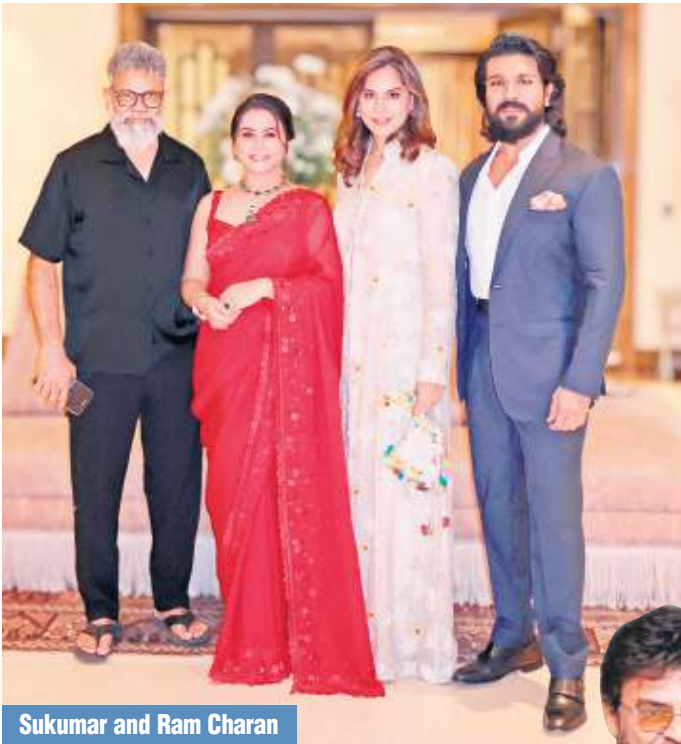
Sukumar and Ram Charan