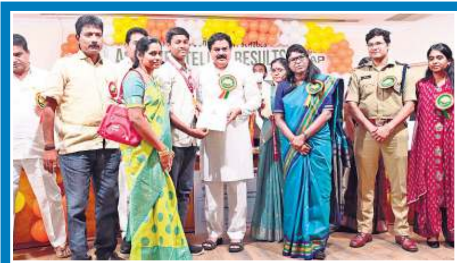
Manohar said the government is prioritising education and healthcare, and significant changes are being introduced. He urged that Eluru district should become a model for innovation in education through coordinated efforts.

He pointed out that out of 2.78 lakh students in the district, only 1.30 lakh are enrolled in Government schools, and stressed the need to increase this number. He suggested that the Zilla Parishad allocate more funds towards education, noting that the district has over 10,000 teachers. The Minister called upon the teaching fraternity to deliver quality education in a