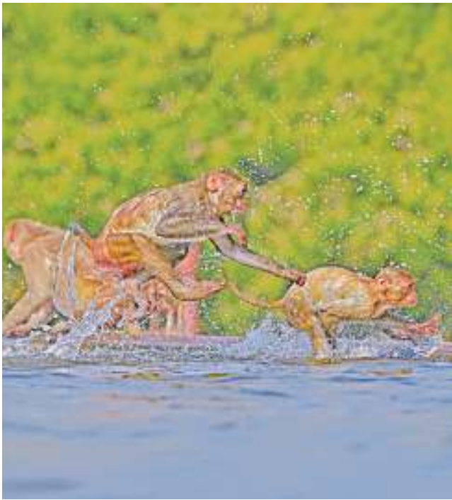
Macaques cool off in a pond on a hot summer day, in New Delhi.

India is witnessing a significant transformation in its educational and professional landscapes, with an increasing number of women enrolling in Master of Business Administration (MBA) programmes and advancing into top leadership roles in the corporate world. This shift marks not only a welcome departure from past trends but also signals a more inclusive and dynamic future for Indian businesses. Historically, business education in India was predominantly male-dominated. However, recent data highlights a steady and substantial increase in the participation of women in MBA programmes.