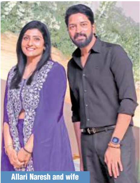
Allari Naresh and wife