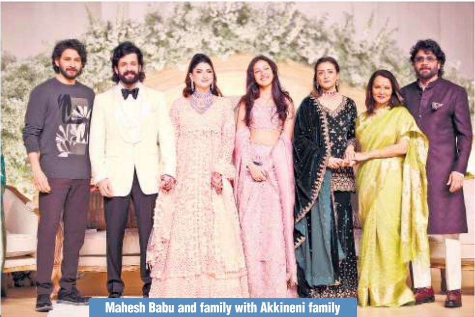
Mahesh Babu and family with Akkineni family